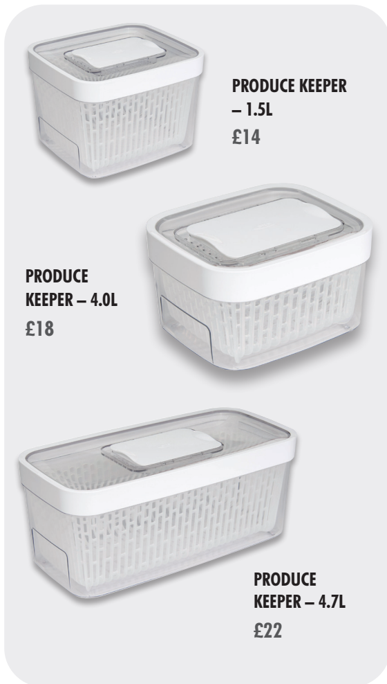
PRODUCE KEEPER – 1.5L £14