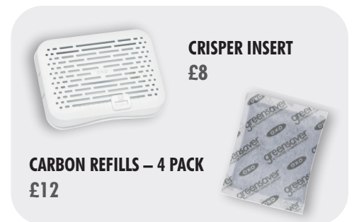
CRISPER INSERT £8