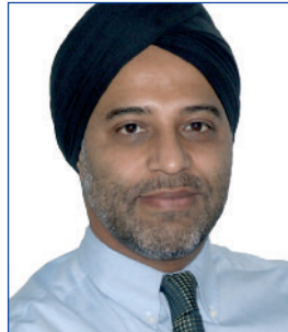
Professor Hardev Pandha who leads our 25 strong lab-based research team

The latest ultrasound technology is leading us to new, non-invasive ways of identifying cancer cells within the prostate. This will allow us to determine which cancers need curing and which can be safely monitored. It also allows us the possibility of just treating the cancerous part of the prostate rather than the whole gland, so minimising side effects.