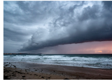
Stormy Left (from £100)

The Cornish Surfer brand aims to bring the best of Cornish contemporary design to luxury homewares and furnishings, with strong ethical and environmental practices behind the production of each range. Founded with a belief in great product design and family values, Anouska and Matt have created a fresh new interpretation of coastal design, with an eco-conscience at its heart.