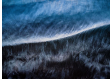
Back Wash (from £100)

photographer whose work captures the unique character of the sea with striking compositions. All photography prints are available in standard A3 size with a white or black frame, or can be created in bespoke frames and sizes.