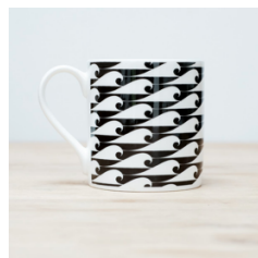
360 mug £12.50

The Cornish Surfer also launches with a range of elegant bone china, hand-finished using traditional methods, here in the UK. The bone china range features two of Anouska's distinctive Cornish designs, to bring contemporary coastal style and luxury to the kitchen or dining table.