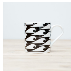
Shorty espresso cup £10.50