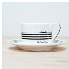
Offshore cup and saucer £22.50