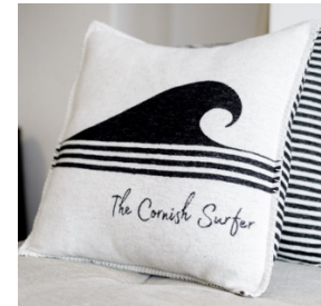
Tides cushion £50.00

The soft furnishings range features a fresh and distinctively bold design created in Cornwall by founder Anouska, in classic Cornish black and white.