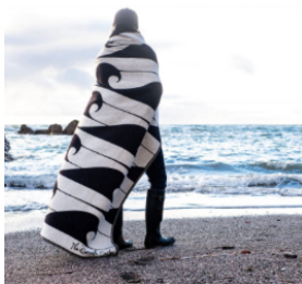
Sennen Cosy large blanket £110.00

The Cornish Surfer has launched with a range of soft furnishings that includes blankets, baby blankets and cushions that are statement pieces for the living room or bedroom. The blankets and cushions are made from high-quality recycled cotton blend, with a hand stitched finish. Cushions are stuffed with inners made from recycled plastic bottles that create a plump and sumptuous feel with a light eco-footprint.