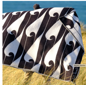
Sennen Cosy large blanket reverse design view