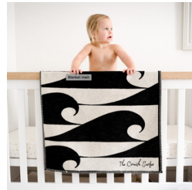
Sennen Cosy Mini baby blanket £55.00