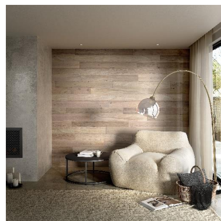
Left to right: 3D Teak Panels- Colorado, £99.99. SlatWall- Acoustic Grey, £159.99. NEW 'Peel and Stick'- Driftwood grey, £49.99.

As the saying goes, don't move, improve! Changing up a space in an instant when on a budget often means making difficult decisions, but small tweaks can provide the ultimate transformation. 2022 interior trends have predicted a big focus on natural materials and colourways and Naturewall's sustainable wall coverings are the ideal quick-fix design update.