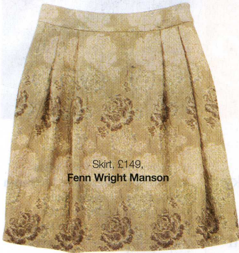
Skirt, £149, Fenn Wright Manson