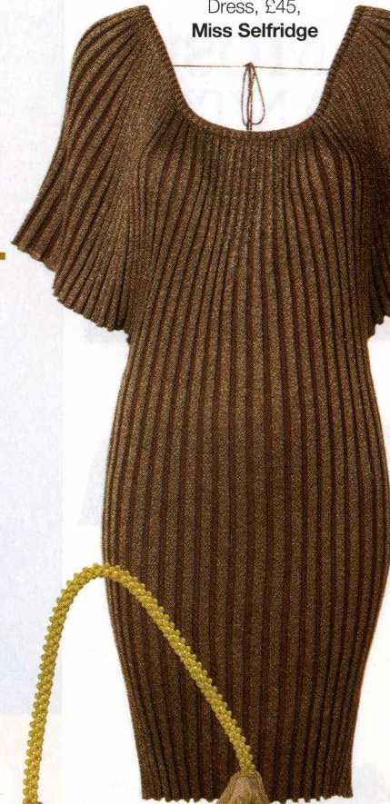
Dress, £45, Miss Selfridge