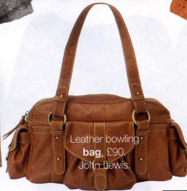
Leather bowling bag , £90, John Lewis.