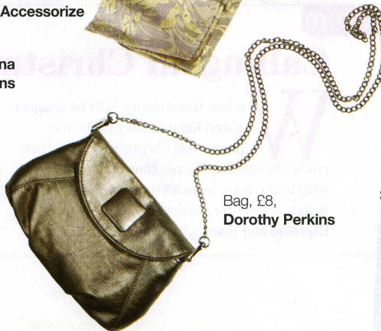
Bag, £8, Dorothy Perkins