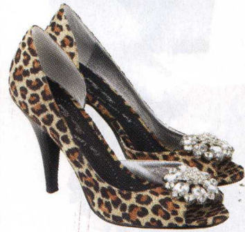
3. Shoes, £49.99, River Island