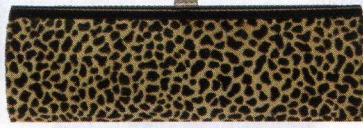
1. Bag, £65, Dune

Go wild for animal print accessories... ideal for glamping up a classic frock!