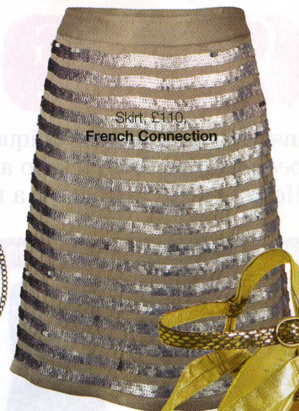
Skirt, £110, French Connection

Warm up a dreary December day with this glamorous trend. For an opulent, luxe feel, team a gold shift dress with black opaque tights, as seen on all the hottest catwalks. Try adding pewter shoes or a silver clutch to your New Year's outfit for extra sparkle, or get your disco shoes on with some fabulous bronze or copper shoes, as seen at Miu Miu .