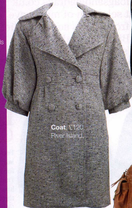
Coat , £120, River Island.