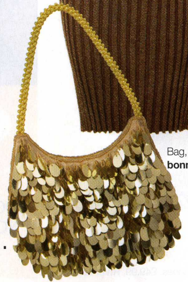
Bag, £10, bonmarch