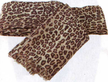
2. Stole, £22, Accessorize