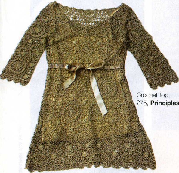
Crochet top, £75, Principles