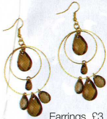
Earrings, £3, Peacocks