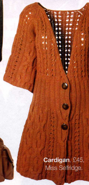
Cardigan , £45, Miss Selfridge.