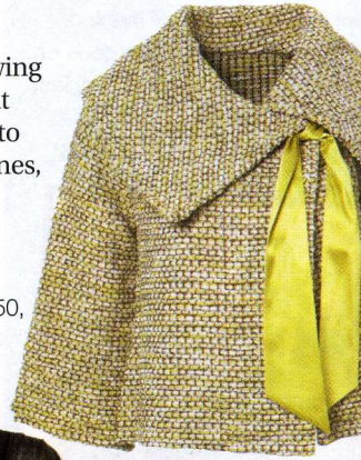
Coat , £50, Wallis.