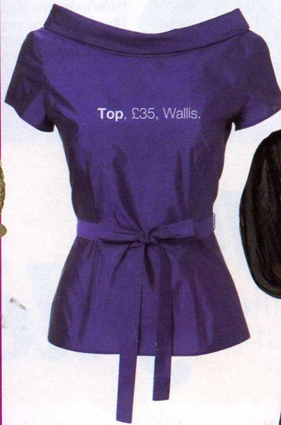
Top , £35, Wallis.

Volume is having maximum impact right now with Edwardian-style puffy sleeves, undulating hems and billowing skirts bursting onto the catwalk and the high street. Look at oversized bags and chunky platform shoes when it comes to accessorising. Balance out the look with cinched in waistlines, cropped jackets and shawl necklines.