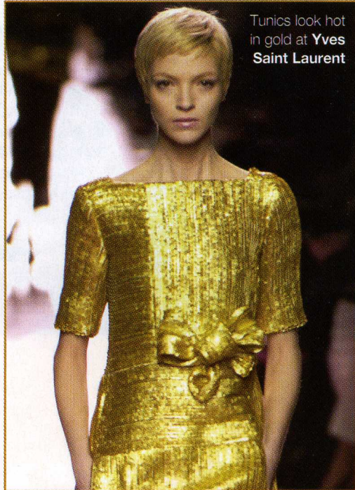
Tunics look hot in gold at Yves Saint Laurent