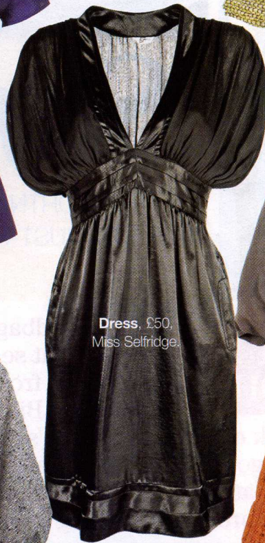
Dress , £50, Miss Selfridge.