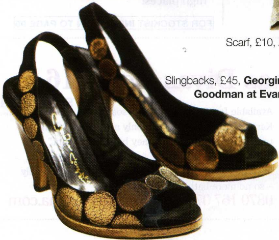
Slingbacks, £45, Georgina Goodman at Evans