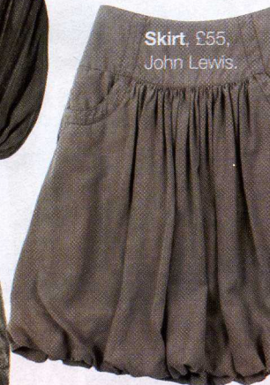
Skirt , £55, John Lewis.