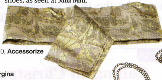
Scarf, £10, Accessorize