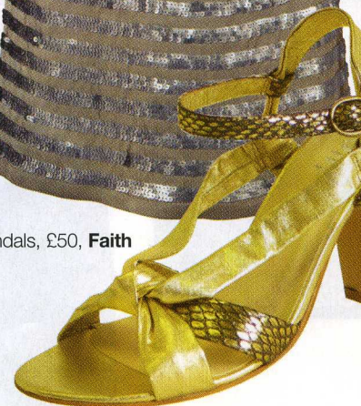
Sandals, £50, Faith