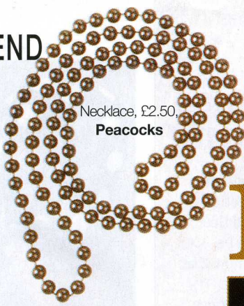
Necklace, £2.50, Peacocks