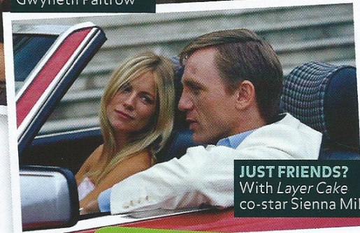
JUST FRIENDS? With Layer Cake co-star Sienna Miller