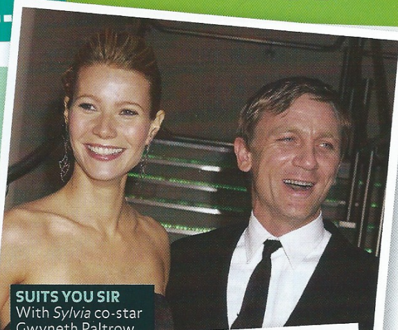
SUITS YOU SIR With Sylvia co-star Gwyneth Paltrow

He's always played down rumours of a romance with infamous pal, Kate Moss. He was also rumoured to have had an affair with his Layer Cake co-star Sienna Miller, at the same time as her then on-off beau, Jude Law, was also hitting the headlines for putting it about with his children's nanny.