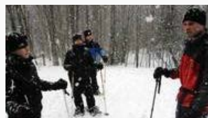
A star in the East

Make it Epic: The popular Epic Pass (epicpass.com) offered by Vail Resorts has expanded, so you can now ski at a whopping 26 resorts worldwide. The full Epic Pass, $729, allows unlimited access to all Vail Resorts properties in the United States, plus five days of skiing at selected resorts in Austria, France and Switzerland.