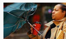
Wet and windy today

Mount Rose (skirose.com), an outstanding family-friendly resort less than half an hour from the Reno airport, has begun a $23.5 million expansion and this year added almost 100 acres of terrain, expanded snow-making capabilities and built a new restaurant up top. The resort