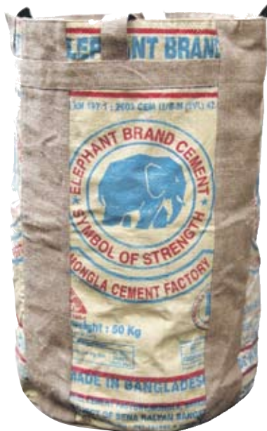
STORAGE SOLUTIONS: Floral embroidered vintage suitcase by Bouf, above left; Ele Jumbo Storage from Ganesha, above right; Vintage Union Chest from The Old Cinema, below.