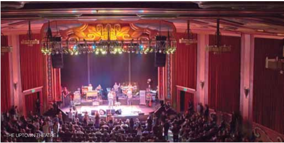
THE UPTOWN THEATRE