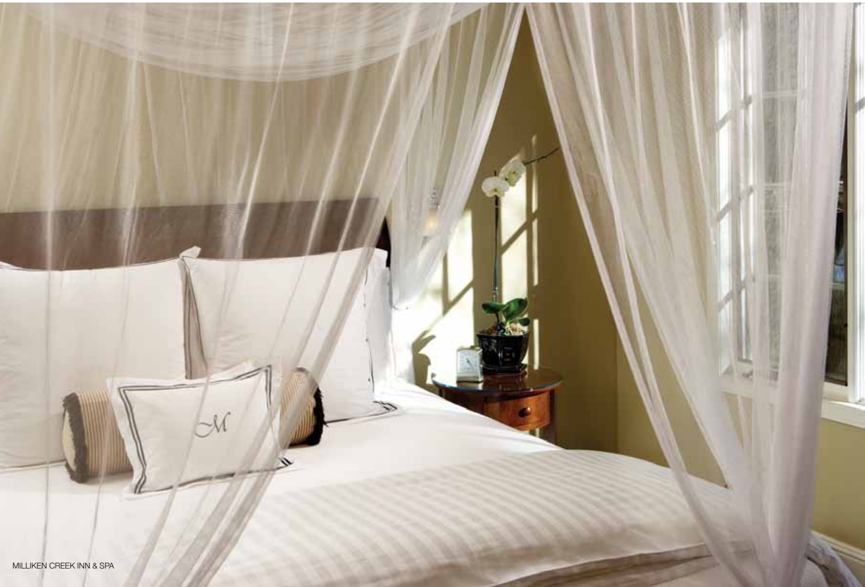
MILLIKEN CREEK INN & SPA