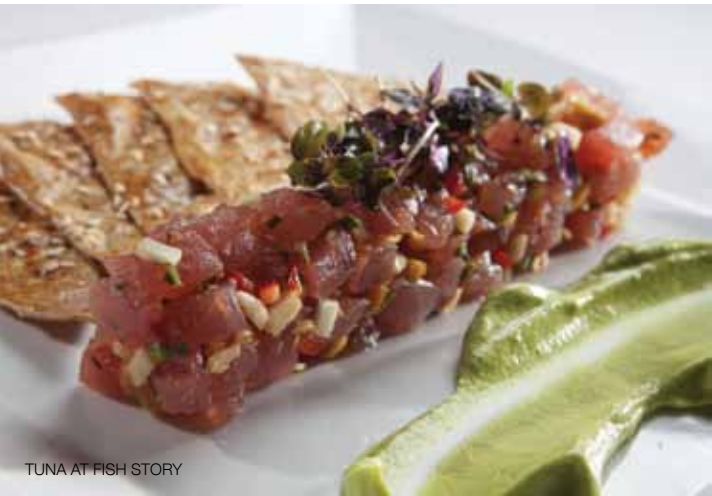
TUNA AT FISH STORY