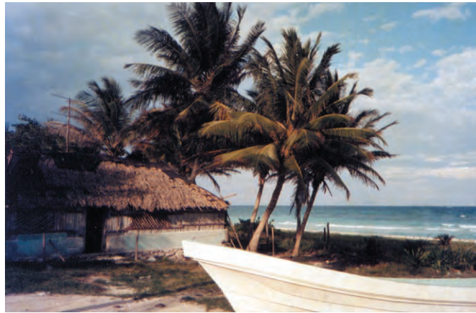
PLAYA DEL CARMEN, 1984