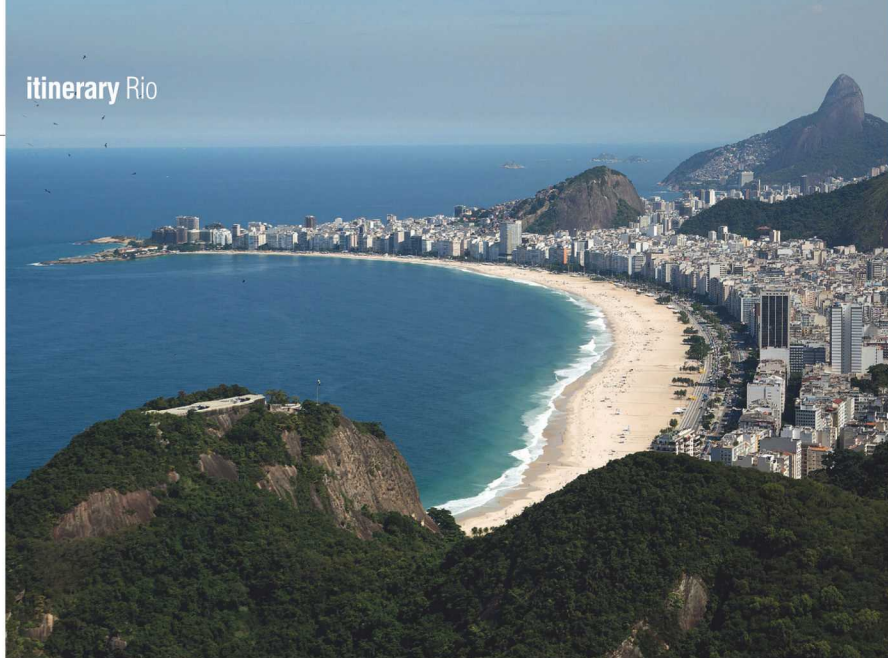
Rio's famed Copacabana Beach, a must-see for all visitors to the city

Basking in a post-World Cup glow and preparing for the global gaze again in 2016, Rio de Janeiro is, arguably, the destination of the moment. Sarah McCay reports