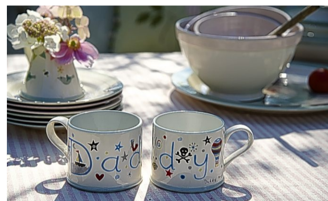
TEA FOR TWO: Daddy Straight Mug £17.00, Susie Watson Designs www.susiewatsondesigns.co.uk or 01892 521859

W:768.22pt H:483.998pt SEPictures : SE-RopAds : 316333359+