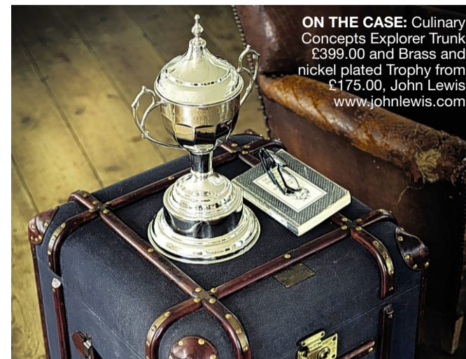
ON THE CASE: Culinary Concepts Explorer Trunk £399.00 and Brass and nickel plated Trophy from £175.00, John Lewis www.johnlewis.com

Surely there’s only a certain amount of socks and chocs he can continue to cope with?