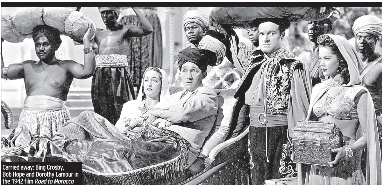
Carried away: Bing Crosby, Bob Hope and Dorothy Lamour in the 1942 film Road to Morocco