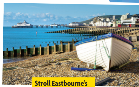
Stroll Eastbourne's classic pebble beach

a double or twin room with continental breakfast (01323 722 676; www.thebig-sleep-hotel.com).