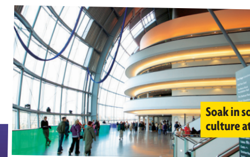
Soak in some culture at The Sage

and jewellery, before stopping off at The Broad Chare (www.the-broadchare.co.uk) for an old-fashioned pub lunch.