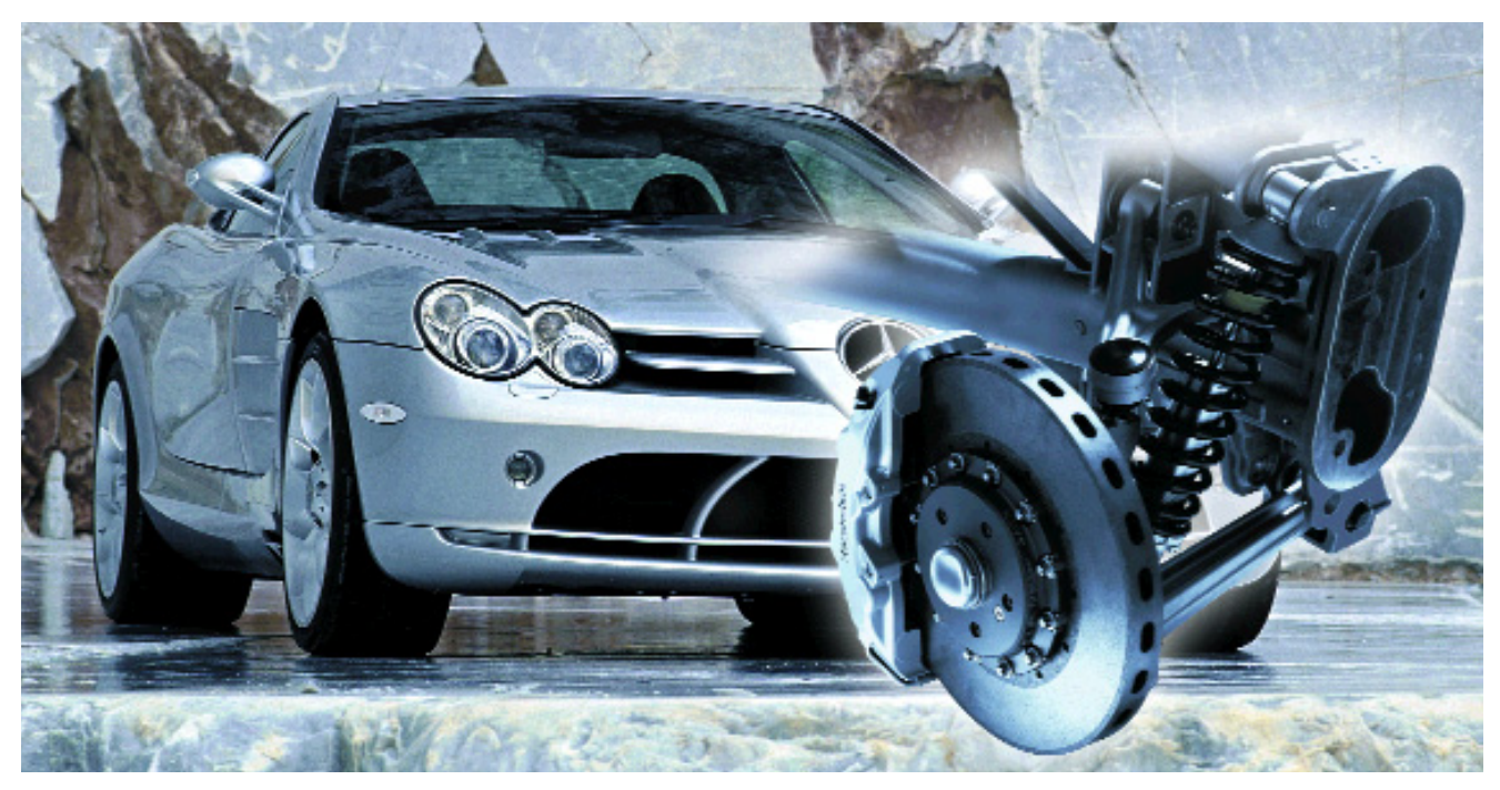
The Mercedes-Benz SLR uses fiber reinforced ceramic brake discs

As an example, Starfire Systems has produced a 13-inch brake disc based on silicon carbide, an extremely hard and refractory ceramic. It weighs 6.5lbs, compared to a conventional steel component, which weighs 21.5lbs. The ceramic components have been tested on a 2003 Chevrolet Tahoe. They were tested on a stationary dynamometer and on the open road. Herb Armstrong, vice president of Sales & Marketing, Starfire Systems said it was still awaiting the results of the tests. Armstrong believes that Starfire Systems is poised to exploit ceramic composite matrix technology, a term he prefers because the company does not use conventional metal matrix technology. He believes that the company is in a stronger position than many of its competitors because "we use known methods of composite preparation that are different from the energy extravagant processes used to make metal matrix composites". He added, "Starfire Systems materials form ceramics at lower temperatures. By doing some machining earlier in the process and firing at lower temperatures we do not have to machine a very dense, hard material."