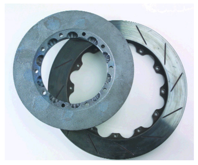
Surface Transforms plc are developing a lightweight carbon fiber reinforced ceramic

see use in other, high-volume applications. A major drive exists to develop materials that will help manufacturers lower engine emissions; materials that are stronger, more temperature resistant, and more wear resistant. MMC components are now seeing use in various powertrain components in current vehicle models, for example, MMC driveshafts and engine components. Thus the potential market for MMCs in such applications would appear to be strong."