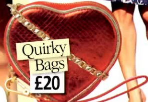
Quirky Bags £20