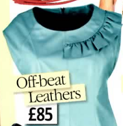
Off-beat Leathers £85