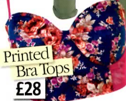
Printed Bra Tops £28