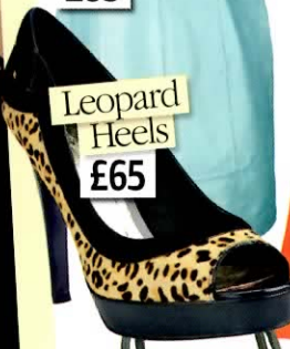
Leopard Heels £65