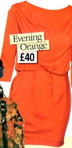
Evening Orange £40