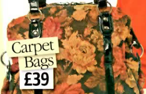
Carpet Bags £39