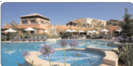
The Hotel viewed from poolside

My room was described as a 'standard room', but hey, this is Aphrodite Hills standard! The room had a large sitting area, ample balcony with sea view, plenty of wardrobe space, a super bedroom area and a massive luxury bathroom with bath and a separate walk-in shower.