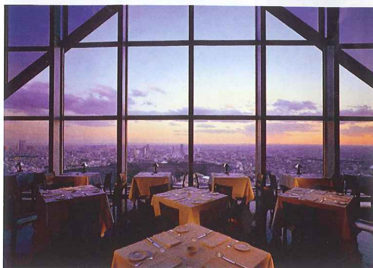
Opposite page: Mount Fuji in all its snow-capped glory. This page, clockwise from top left: Trees full of cherry blossom in spring; super-fresh sushi; Sumo wrestlers ready for battle; Tokyo's Shinjuku District at night; The stunning view from Park Hyatt Tokyo's signature restaurant.