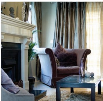
Living Room, House A, Enniscrone