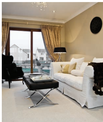
Living Room, House B, Enniscrone

I love all the beautiful antique shops on Clanbrassil Street. I also love shops that you can get little accessories in, cute girly things. I love London, especially Harrods – they have fabulous furniture. They're very costly but, rather than squandering money on something else, I'd save up and get