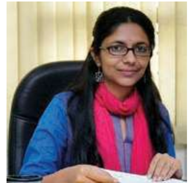
Swati Maliwal, chairperson of the Delhi Commission for Women, was part of a campaign that forced India's banks to drop their policy of refusing employment to new recruits who are pregnant.