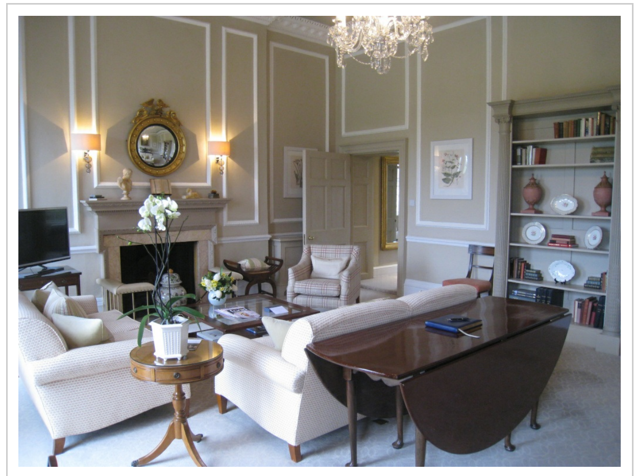
Sir Percy Blakeney Master Suite living room, c. Royal Crescent Hotel

The Sir Percy Blakeney Master Suite features a dual aspect with uninterrupted views of the River Avon at the front and, of course, the splendid Crescent extending on either side. The bedroom overlooks the beautiful garden. The views alone allow a tiny glimpse into the world of Jane Austen. Bath has changed little since the English novelist's time.