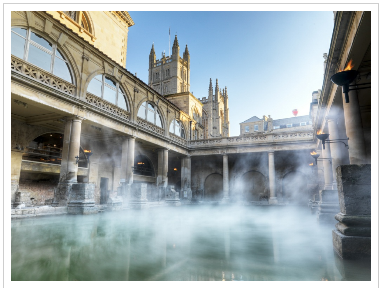
No visit to Bath would be complete without visiting The Roman Baths, c. Visit Bath

The best way to enjoy the stunning architecture, the alleyways, mews streets and the Coliseum-shaped Circus is to walk. The Royal Crescent Hotel & Spa is perfectly situated to explore the <u>Assembly Rooms</u>, the <u>Roman Baths</u> and The Pump Room, and <u>Bath Abbey</u>. The many museums include <u>The Holburne Museum</u>, <u>The Victoria Art Gallery</u> and <u>The Herschel Museum</u> of astronomy. Take a break from the art and culture to do a little shopping in the abundance of luxury and independent retailers.