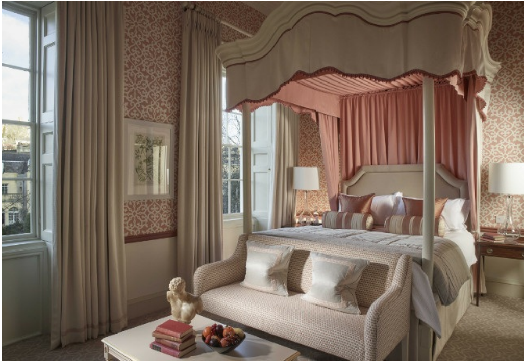
The Sir Percy Blakeney Master Suite offers luxurious comfort

To the rear is an acre of glorious gardens featuring a walled garden and the Taittinger Spa Garden. The Dower House Restaurant and The Montague Bar & Champagne Lounge, where the menus are French influenced and the service is surely worthy of a Michelin star, are located here. The elegant Spa & Bath House, where I enjoyed a relaxing Hot Stone Massage, is also accessed through the garden. Thoughtfully, there is a stash of hotel umbrellas placed at all exits for guests' use in inclement weather.