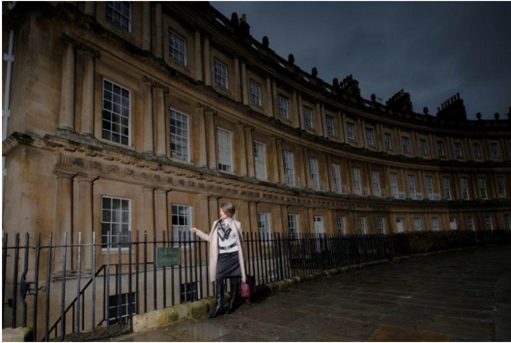
Bath boasts stunning Georgian architecture.

Right in the centre of this magnificent row of Palladian beauties is Nos. 15 and 16, otherwise known as The Royal Crescent Hotel & Spa. External signage is discreet due to Landmark compliance and you feel as though you are entering an elegant private residence.