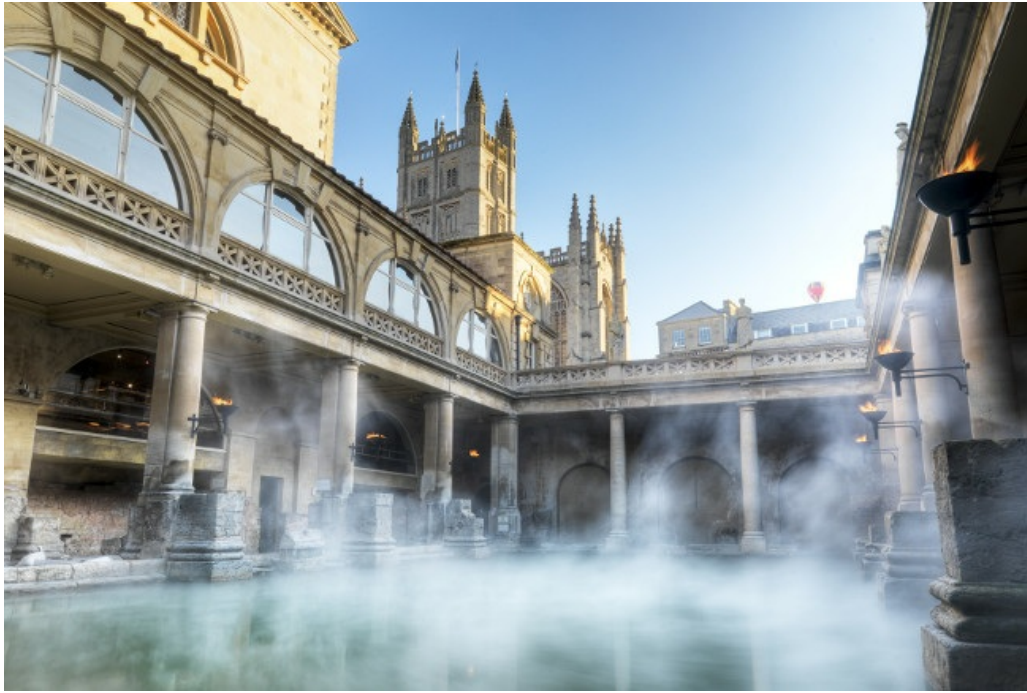
The Roman Baths are just one of many attractions in the city.