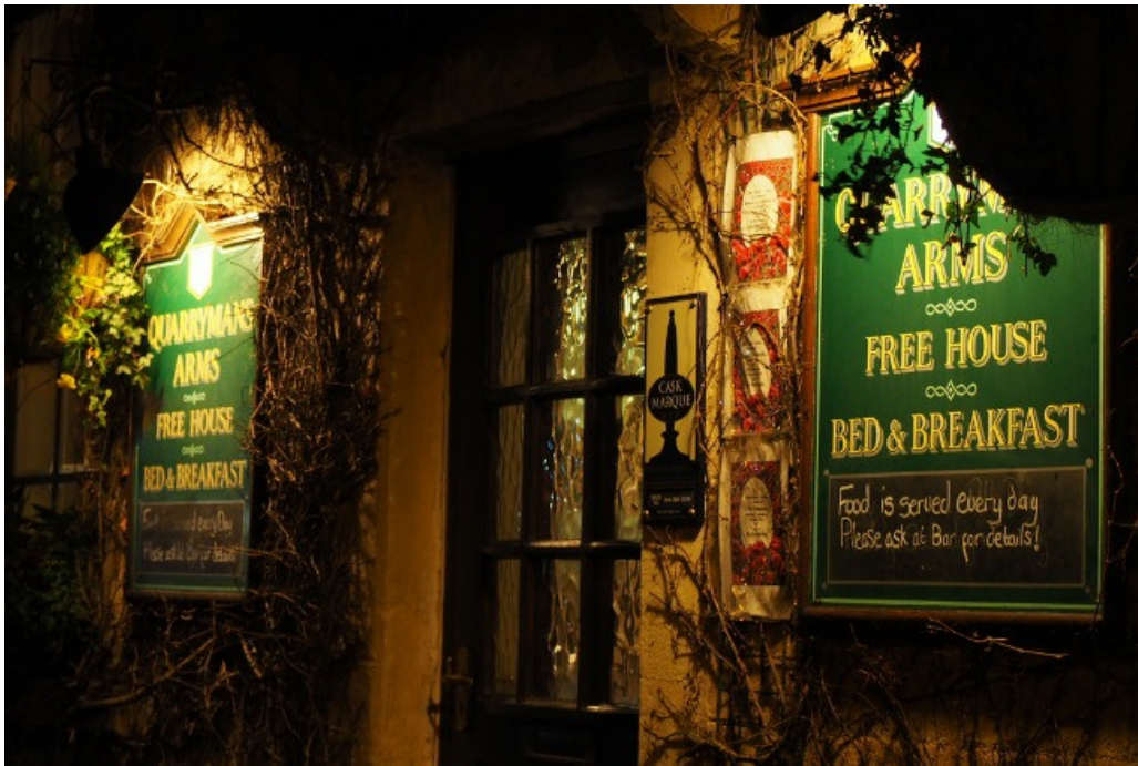
Around & About Bath offer bespoke small group tours of Bath and the local area