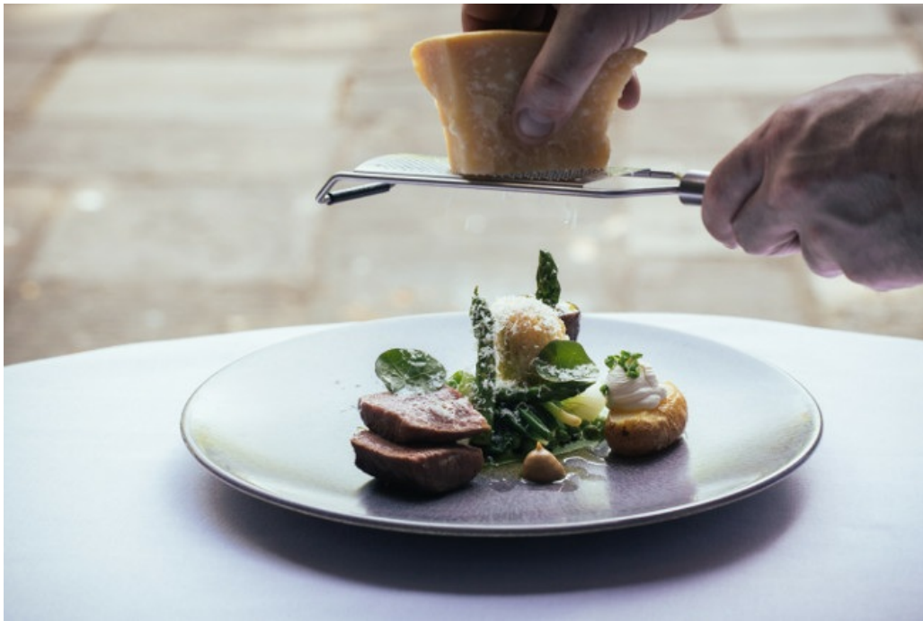
The Dower House Restaurant serves a French inspired menu