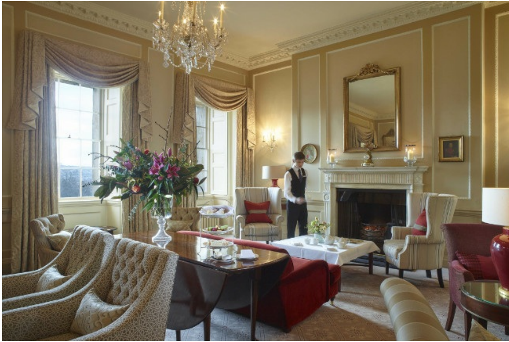
The Drawing Room is the perfect spot for afternoon tea

The suite's furniture and paintings compliment the history and spectacular architecture of the house and the living room ceiling is opulently decorated in swirls of pale pink and cream 'icing' plaster. Every comfort is provided including a sumptuous three-poster bed, lavish soft furnishings and a contemporary bathroom stocked with Floris' toiletries, fluffy white towels, bathrobe and slippers. The latest technology featured faultless Wi-Fi connection, two large plasma televisions and an excellent sound system for music on the nightstand.