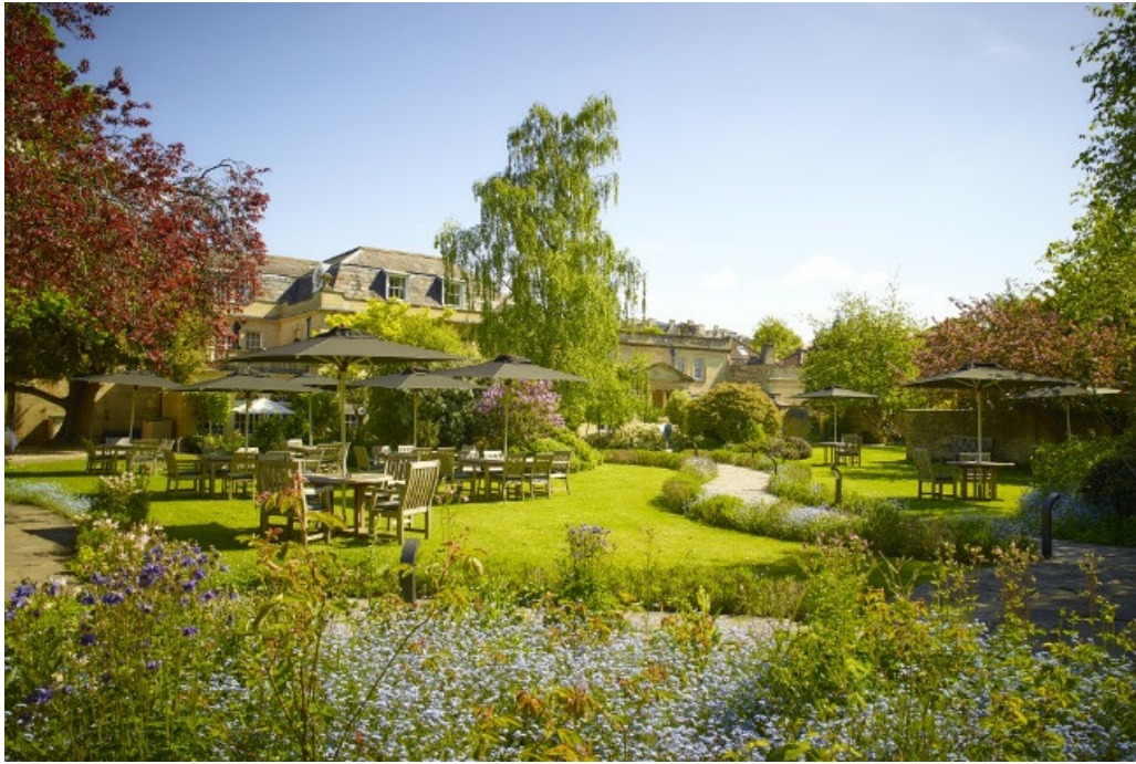
The hotel has delightful gardens for guests to enjoy

On arrival the concierge whisks away your car for safekeeping and transfers your luggage to your suite. Bowls of informally arranged fresh flowers adorn the furniture and the latest glossy magazines are laid out on coffee tables. There is always someone discreetly on hand to anticipate guests' every need. Beautiful artworks from the RCH's curated collection are part of the hotel decoration, including a stunning copper sculpture by South African artist Stephen Myburgh, suspended from a tree in the garden.