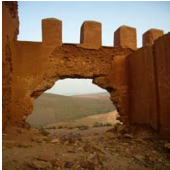
Serene scenes: clockwise from top left, Mirleft

Those who have found the laid-back vibe particularly infectious should saunter over to Aftas Plage, a petite pit-stop